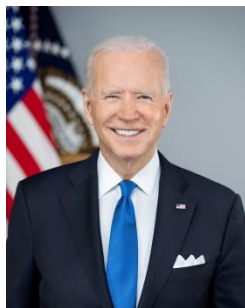
Joe Biden (2020 to date)