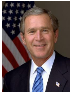
George W Bush (2000 to 2008)