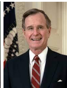
George HW Bush (1988 to 1992)