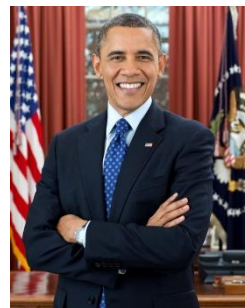
Barack Obama (2008-2016)