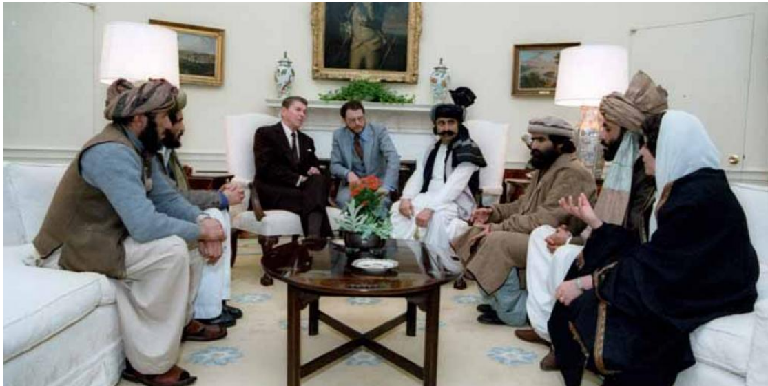
Reagan termed the Mujahedeen as having moral equivalents as of American forefathers

Actually, there was no insurgency until first five years after the invasion. The insurgency began with the raids, drone attacks and bombing the Mujahedeen who once CIA recruited to fight the Soviets in the 1980s. Since Russia had surrendered and gone back, Mujahedeen were named as the warlords or terrorists and Washington took them as a threat against the regional control by Washington.