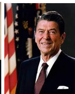
Ronald Reagan (1980 to 1988)

The United States of America, since long is taken as the Land of Opportunities, but time has proved it should be termed as: