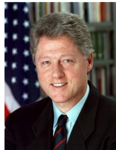
Bill Clinton (1992 to 2000)