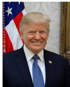
Donald Trump (2016 to 2020)